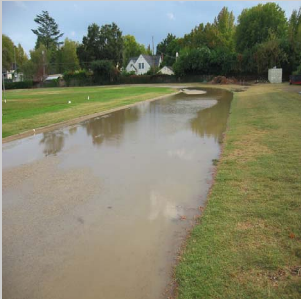
The Reality... Current Track at McClatchy HS

These pictures were taken on the SAME DAY: